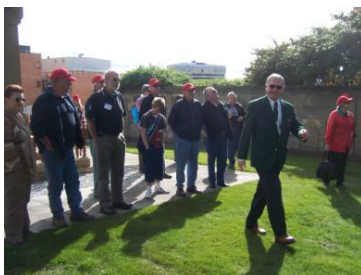
Touring Anglesea Barracks