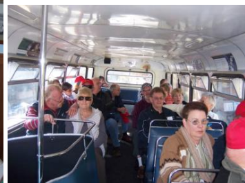
“On the buses.”