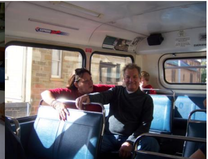
The Burnetts taking in the sights.